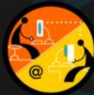
Guruji Cyber Laws Tutor

This Guruji tutor is an innovative interactive case based product that covers information and understanding about various laws and guidelines pertaining to Cyber Crime and Prevention of the same. Guruji Cyber Laws is a product targeted at educating the learner on what Cyber Crime is, and its types. It provides tips of how to carefully browse Internet. Further it teaches what Cyber Laws, its importance and advantages. Guruji tutor further teaches the learner about Cyber Jurisdiction, Cyber Ethics, and details about hosting sites on Internet, e-commerce etc.