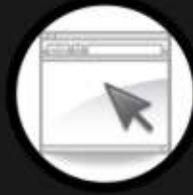
Guruji MS Office Tutor

This Guruji tutor facilitates hands-on learning of Microsoft's flagship operating system Windows. This tutor helps user learn how to install and troubleshoot the operating system. It will make the user self sufficient to manage day to day work.