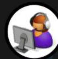
Guruji Spoken English Tutor

This Guruji tutor helps the learner to understand and practice basic conversation skills and vocabulary; including day to day conversation situations like - how to greet people, knowing more about them and how to make use of the language in their daily routine. Making the user aware of the scenarios which the user may come across when going around a place, about basic necessities, making him know the objects he may come across, things he may need while planning a journey, skills of describing a place, about telephone manners, basic etiquettes of talking on phone, extempore questions and their model answers. Tutor covers Group Discussion skills, Interview skills, Presentation skills, Business Communication do's and don'ts, Formal and social conversations, BPOs requirements, Body Language and to sum it all Lastly it teaches English Grammar.