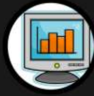
Guruji Windows Tutor

This Guruji tutor helps the user learn about the Origin of Internet, its growth and benefits. It explains user the Computer configuration required to use Internet, What is a Network, types of Networks and various Networking Devices. User will learn about connecting to internet, email, messenger service, video conferencing, etc. User will also learn about various e-commerce services like Online banking, Travel booking, Bill payment, etc.