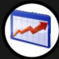
Guruji Tally Tutor

This Guruji tutor is an innovative interactive case based product that covers information and understanding about various laws and guidelines pertaining to Cyber Crime and Prevention of the same. Guruji Cyber Laws is a product targeted at educating the learner on what Cyber Crime is, and its types. It provides tips of how to carefully browse Internet. Further it teaches what Cyber Laws, its importance and advantages. Guruji tutor further teaches the learner about Cyber Jurisdiction, Cyber Ethics, and details about hosting sites on Internet, e-commerce etc.