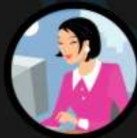
Guruji Internet Tutor

This Guruji tutor helps the user learn about the Origin of Internet, its growth and benefits. It explains user the Computer configuration required to use Internet, What is a Network, types of Networks and various Networking Devices. User will learn about connecting to internet, email, messenger service, video conferencing, etc. User will also learn about various e-commerce services like Online banking, Travel booking, Bill payment, etc.